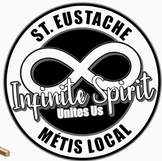
St. Eustache Métis Local