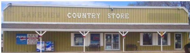
St. Francois Xavier Country Store